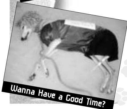
Wanna Have a Good Time?