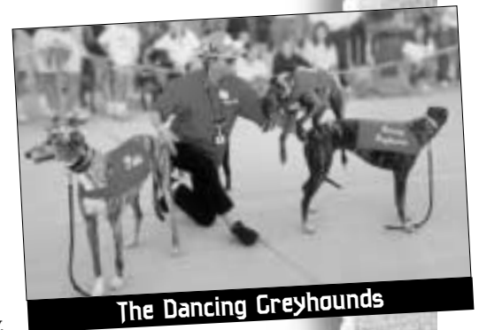
The Dancing Greyhounds