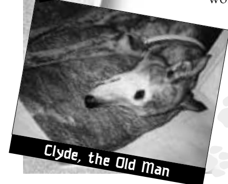
Clyde, the Old Man