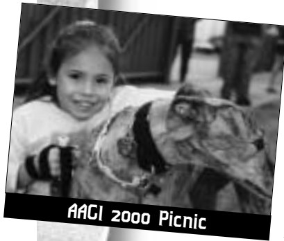
AAGI 2000 Picnic

October will go down as one of the rainiest in history, and things were not looking good for our Annual Picnic and Fund-raiser. So much time and effort goes into planning this event. Rain just wasn't an option. The week before the picnic, we watched the weather reports vigilantly, and each day things looked a little more promising.