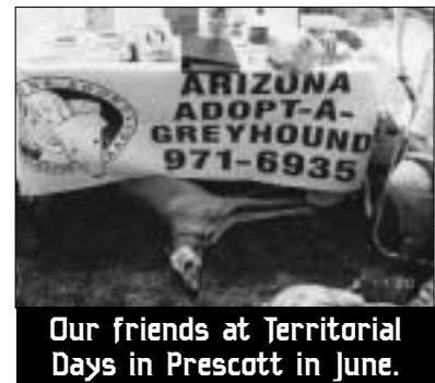
Our friends at Territorial Days in Prescott in June.

Avoid the adoption trailer from 7 - 8 pm if possible.