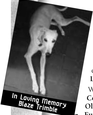
In Loving Memory Blaze Trimble