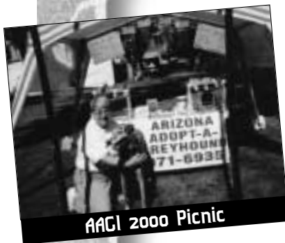
AAGI 2000 Picnic

Saturday, November 4th, finally arrived, and as we all arrived from different parts of the Valley, we were surprised to see that even though it was raining in the East, West and North, the sky was relatively clear directly over Phoenix Greyhound Park! Lucky for us the weather held all day and we had a terrific picnic.