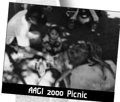
AAGI 2000 Picnic